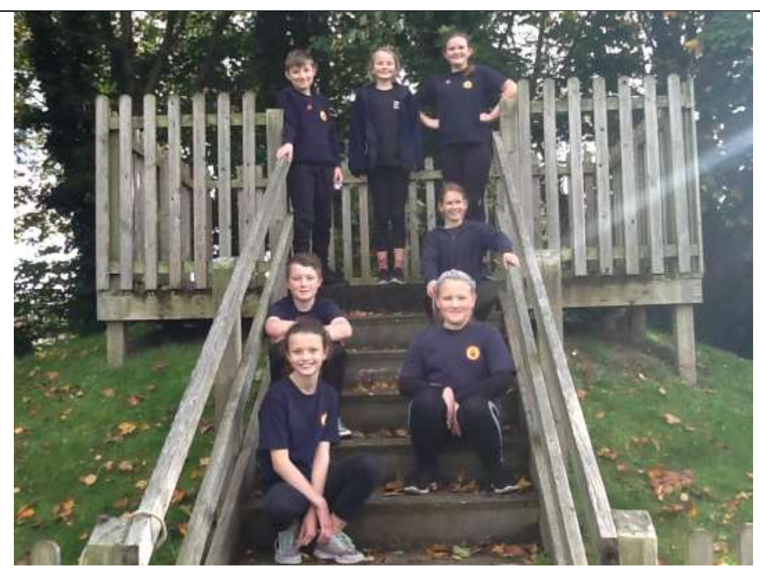
Congratulations to our New 2020 Prefects!