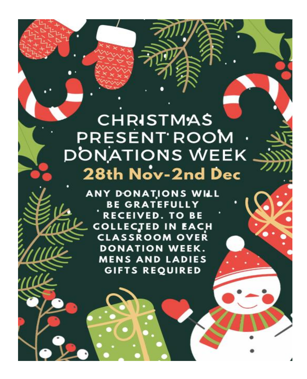
On the Christmas Fair day

The present room will be open and children can purchase gifts for parents at £1 each, Teachers and Yr6 students will help them wrap their gifts.