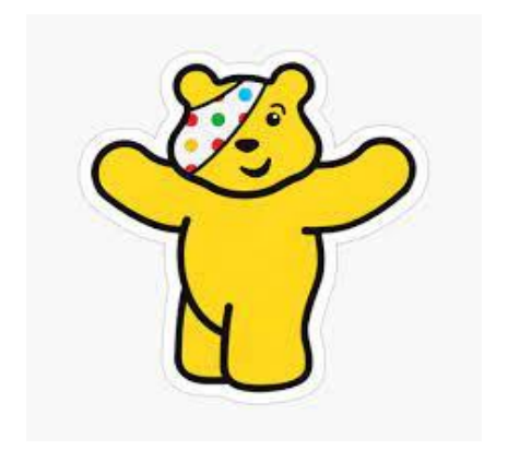
Thank you to everyone who donated to Children in Need on Friday 18<sup>th</sup> November we raised a fantastic £103.40